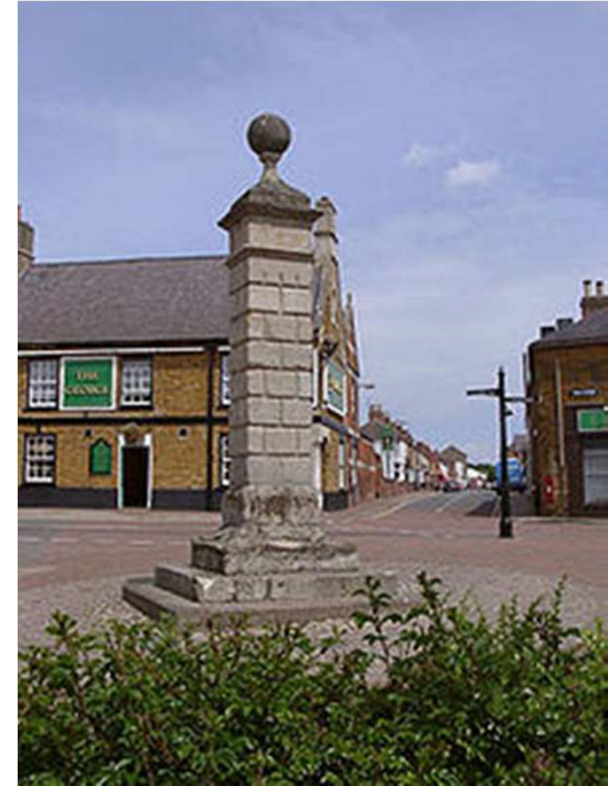
DESBOROUGH TOWN CROSS