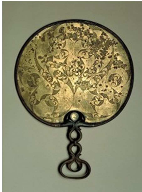
THE DESBOROUGH MIRROR