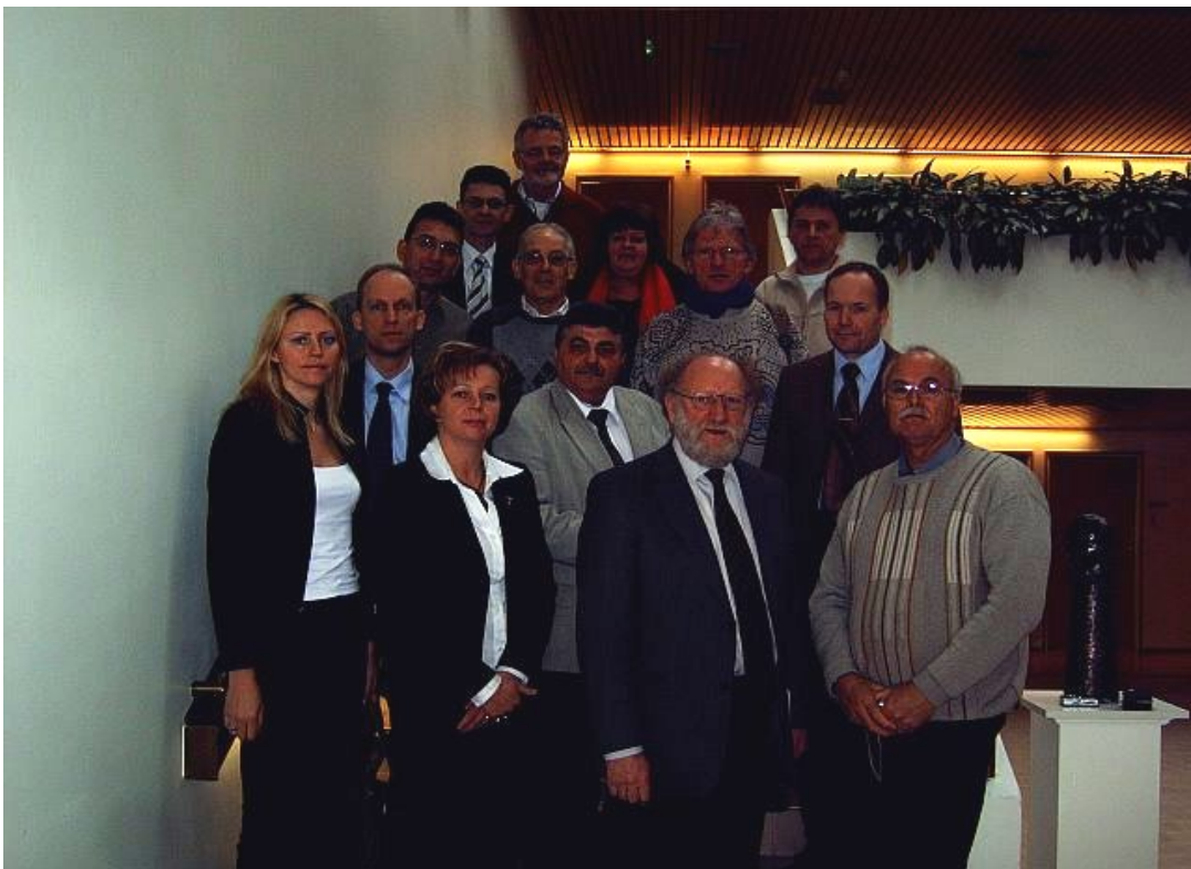
Participants of the small meeting in Kannus

Kannus organised the summer meeting in 1999. They have a lot of experience with the Charter. Kannus has a good contact with Polva, teachers do a lot of things together. Pupils and teachers are going to Polva. Kannus entrepreneurs have contacts with Ockelbo about several businesses. Kannus will participate in the youth meeting in Bucine.